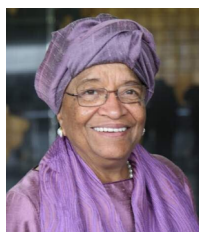
H.E. Ellen Johnson Sirleaf Former President of Liberia