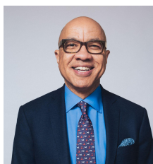
Darren Walker President, Ford Foundation