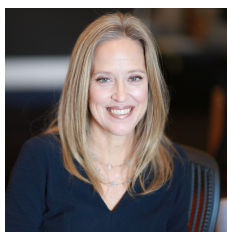
Wendy Kopp CEO & Co-Founder, Teach For All (moderator)