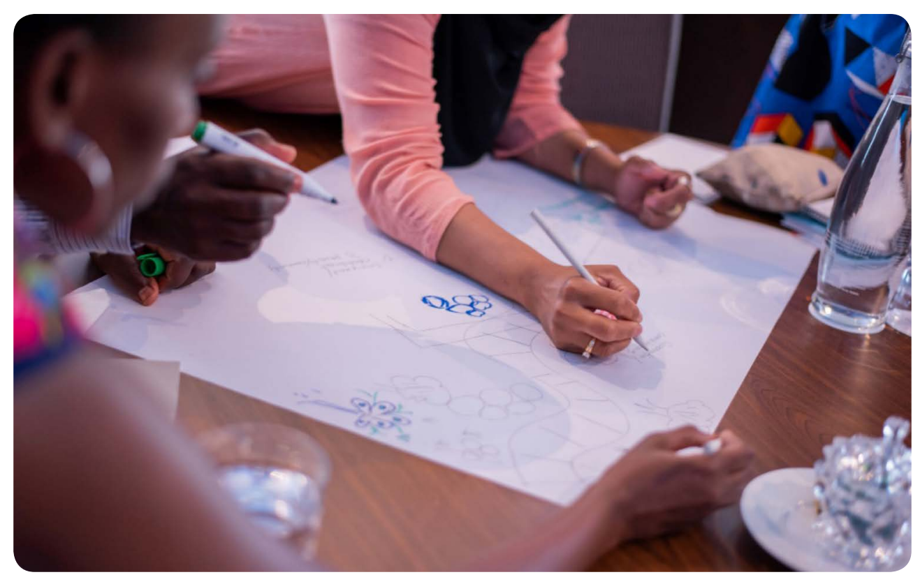
RELI team in a collaborative learning session

One such example is the Assessment of Lifeskills and Values East Africa (ALiVE) where RELI organisations from Kenya, Uganda and Tanzania are developing, with a clear agreed focus, an open-source East Africaspecific life skills assessment tool. The ALiVE program is conducting household assessments on the current state of life skills in East Africa, among both in-school and out-of-school adolescents aged 13 to 17 years.